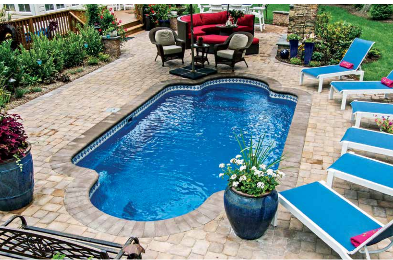
Roman™ in Sapphire Blue

Why does one particular design endure for centuries while others are soon forgotten? The timeless elegance of the classic Roman™ style swimming pool is as much in vogue today as it was in the days of Ancient Rome.